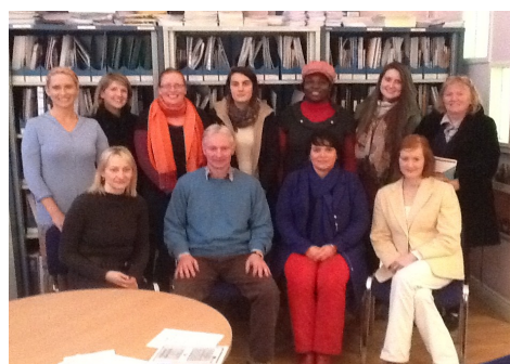
UCC MA Guidance Counselling Class & Guidance Staff in CCAGs Information Resource Centre

The current UCC MA Applied Psychology (Guidance Counselling) Class visited the service in December to learn more about the service and education/ career options in Cork city. The Information Officer and Guidance Counsellors shared their own experiences of working with people who are unemployed and looking to add to their skill set or change direction in their careers.