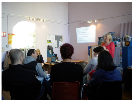
CAO participants & guidance staff in 22 South Mall